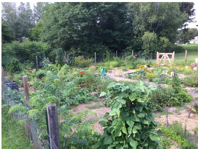
Gardener's plots in full bloom