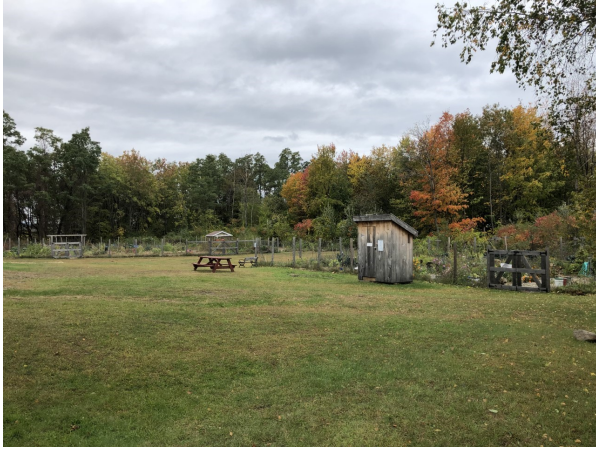
View of both gardens from the north.

Volunteers help plant raspberry bushes for everyone to eat.